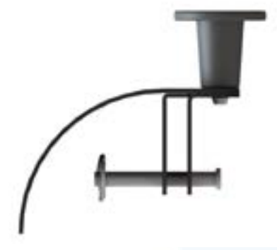
2" Stringer Appication